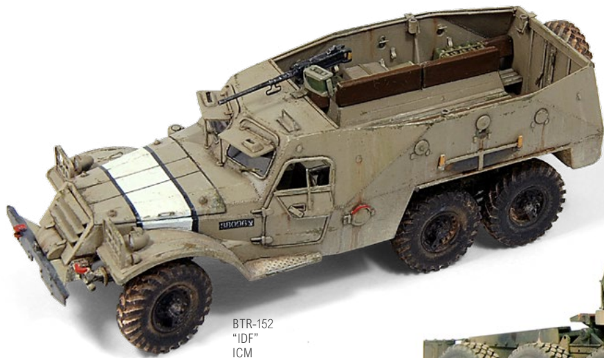
BTR-152 "IDF" ICM 1/72