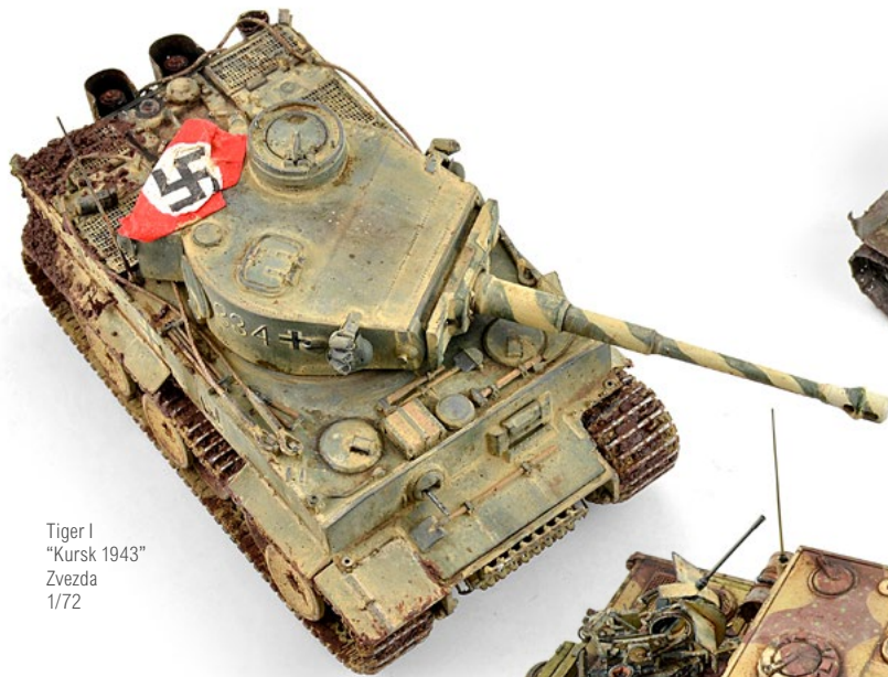
Tiger I "Kursk 1943" Zvezda 1/72