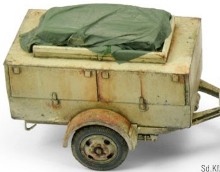
Sd.Kfz.7/1 Revell 1/72