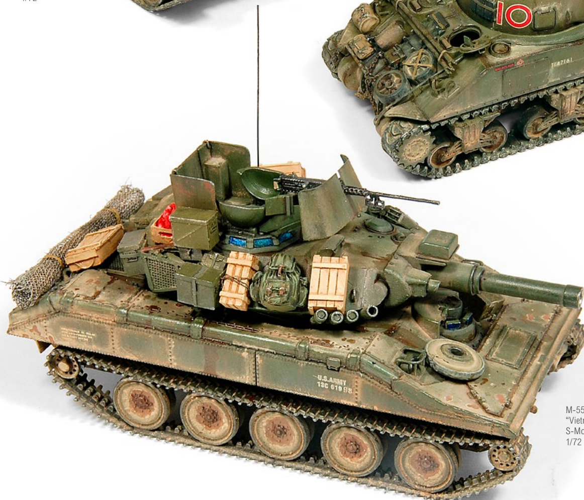
M-551 Sheridan "Vietnam War" S-Modell 1/72