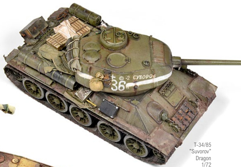
T-34/85 "Suvorov" Dragon 1/72