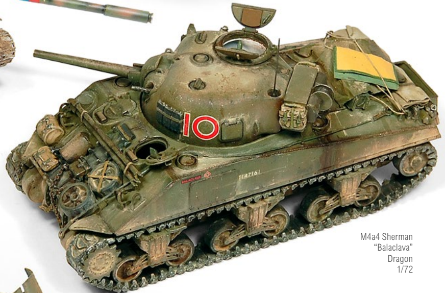
M4a4 Sherman "Balaclava" Dragon 1/72