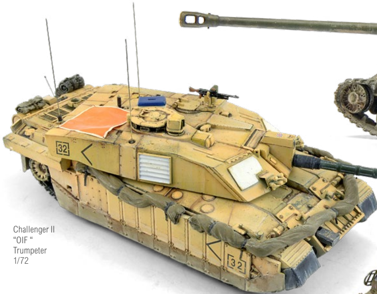
Challenger II "OIF" Trumpeter 1/72