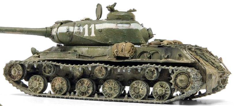
JS-2 "Berlin 1945" Italeri 1/72