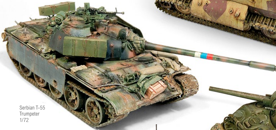
Serbian T-55 Trumpeter 1/72