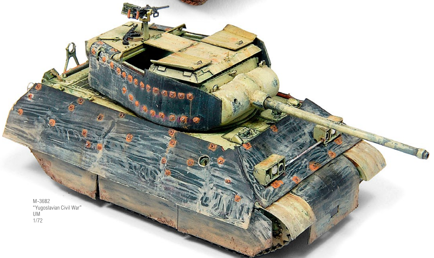
M-36B2 "Yugoslavian Civil War" UM 1/72