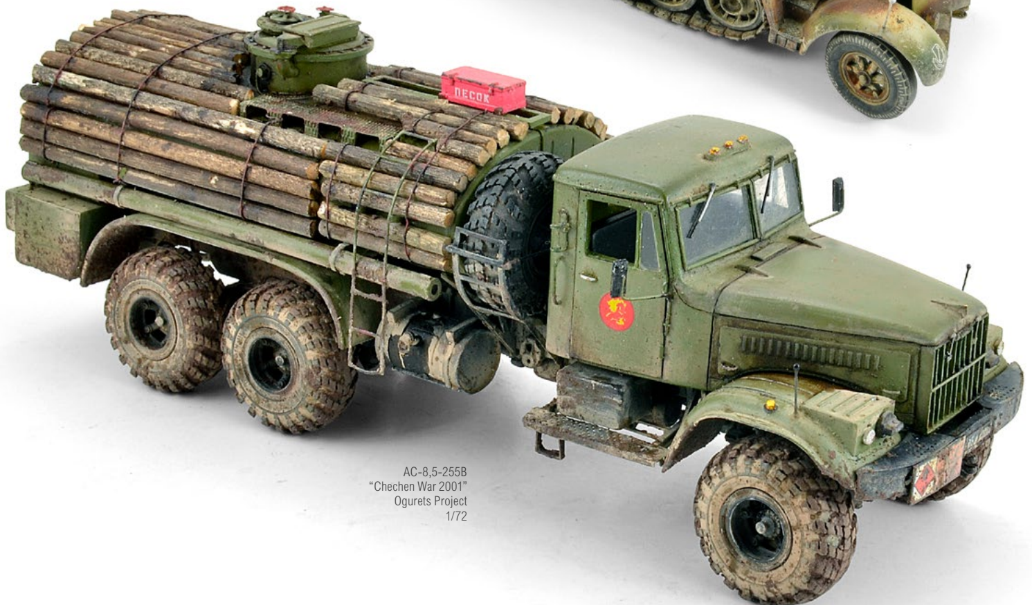
AC-8,5-255B "Chechen War 2001" Ogurets Project 1/72