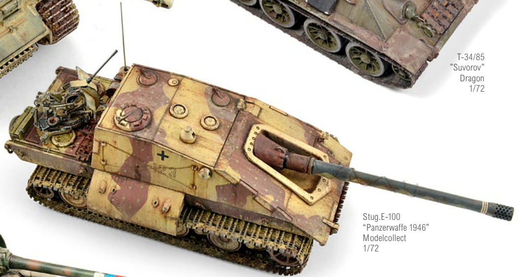
Stug.E-100 "Panzerwaffe 1946" Modelcollect 1/72