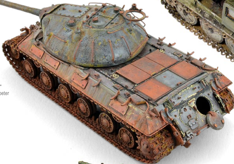
JS-3 "Rust" Trumpeter 1/72