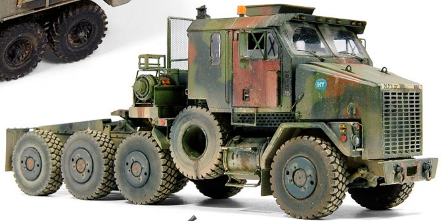
M-1070HET "OIF" Balaton Model 1/72