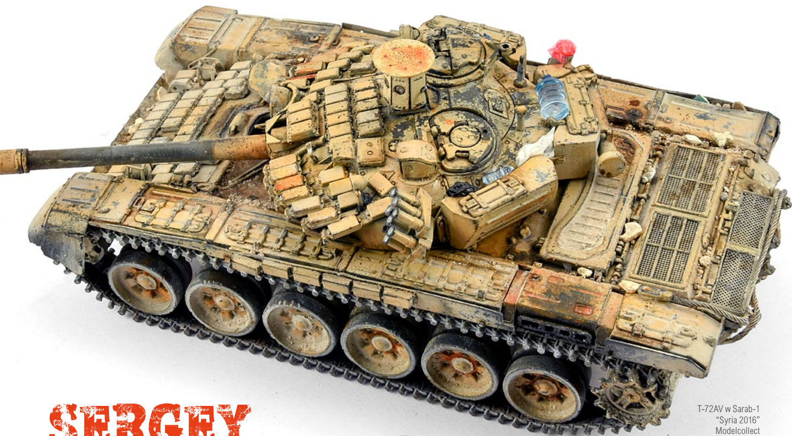
T-72AV w Sarab-1 "Syria 2016" Modelcollect 1/72