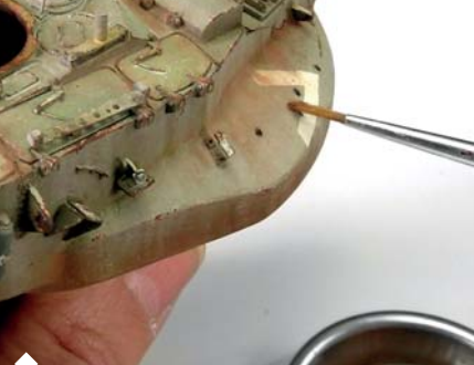
Mixed with light pigment, this time, it has also been used for dusting.