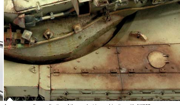
Appearance after application of the product in combination with AK025 Fuel Stains and dark oil.