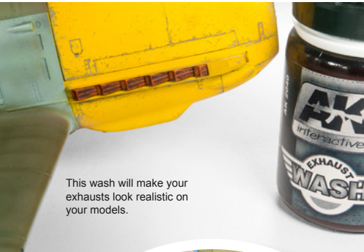
This wash will make your exhausts look realistic on your models.