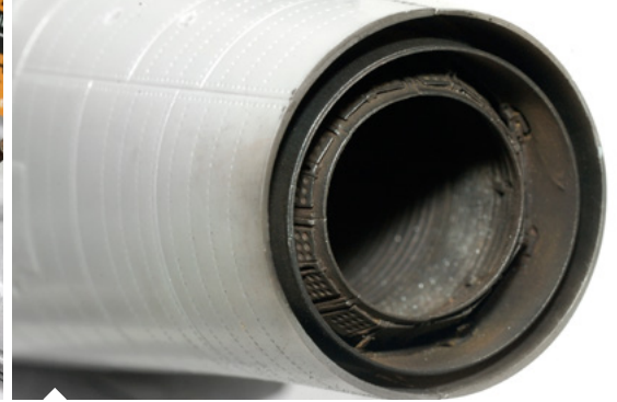
As you can see the final result is very convincing.