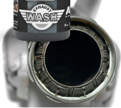
Apply the wash directly from the bottle with a round brush.

PENTINE. We recommend that this product is applied to surfaces that have been painted or varnished with acrylic paint.