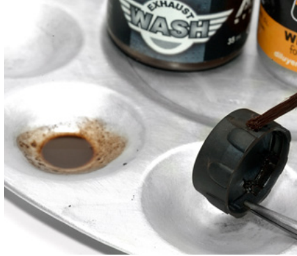
Use white spirit to remove the excess wash.