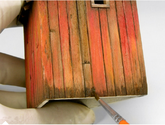
Darken the bottom of the planks...