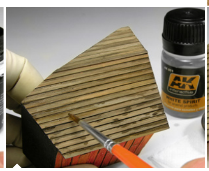
After a few minutes, and once dry, remove the excess with a clean brush and AK011 White Spirit.