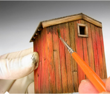
We can use it either to darken a specific area.