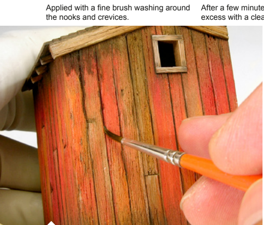
...or highlight the lines of separation between the planks.