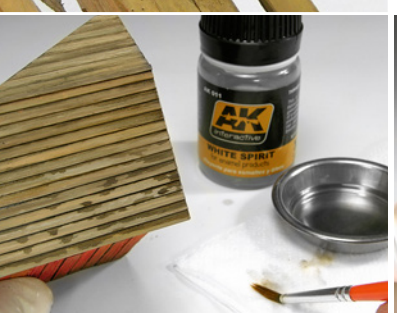
It is convenient to clean the brush as we remove the wash excess