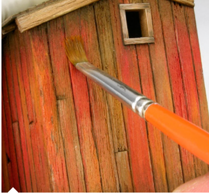
In this case, to remove the excess and extend well, is more convenient to use a flat brush